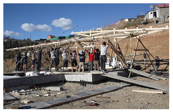
Figure 2B. Student design build workshop, June 2018

The methodological approach of the Design Manual has been to intersect research, including fieldwork, mapping and analysis, with design practice and education, through studio projects and design build workshops. The project has involved collaboration with key NGOs such as Ger Hub and the Asia Foundation who have experience working in the districts to conduct household surveys and organise community engagement workshops. As we develop the underlying knowledge of the districts, including the population structure, income, house type, and how they transform over time we also conducted design studios bringing students to site. As well as providing the students with a unique learning experience, our continued involvement and series of