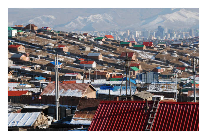
Figure 1.Chingeltei Ger District looking towards the city. 2019.

The paper will explain how the project innovated with passive environmental strategies to provide a low-cost solution to reduce energy consumption and the reliance on coal as a heating source. Operational since January 2020, the article will report on the effectiveness of the prototype in terms of its environmental performance and its capacity to become a model for community provision that can be replicated across other ger district areas.