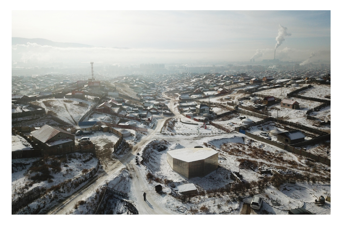
Figure 3. The Ger Innovation Hub, winter 2019.

briquettes that was made mandatory by the government in March 2019, composting toilets, or methods to prevent heat loss. They will hold kids play sessions and after-school clubs and bring the community together for discussions, events and performances. It will offer an alternative place to go in winter, when due to the extreme cold, most residents are confined to their households.